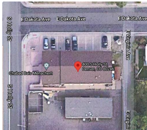
Figure 3 : Chabad Bais Menachem

Chabad Bais Menachem 400 S Holly St, Denver, CO 80246 10 off-street spaces, 9 off-street parking spaces available.