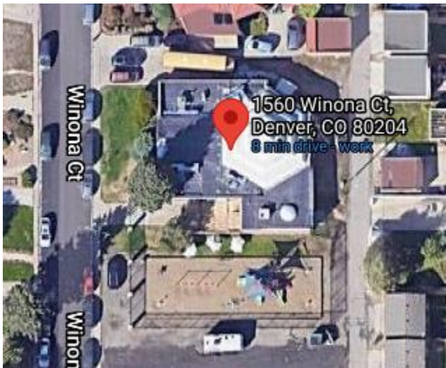
Figure 4 : Congregation Zera Abraham

In addition to the comparison of other Orthodox Synagogues, the existing building (proxy) of Ohr Avner (at 11100 E. Mississippi) was utilized for a parking demand survey.