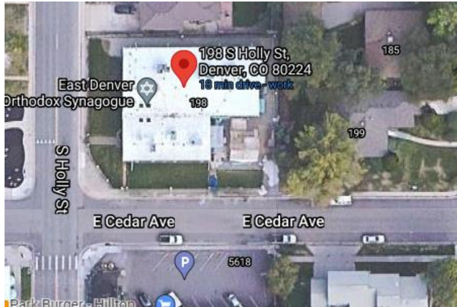
Figure 2 : East Denver Orthodox Synagogue

Chabad Bais Menachem 400 S Holly St, Denver, CO 80246 10 off-street spaces, 9 off-street parking spaces available.