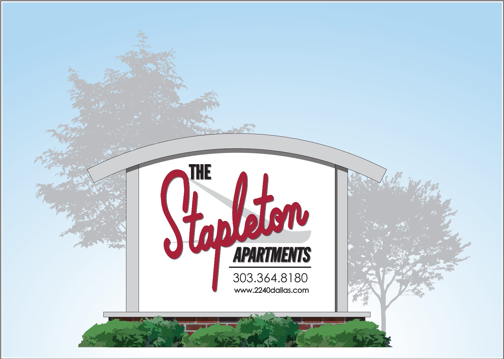
PROPOSED 1/2" = 1'