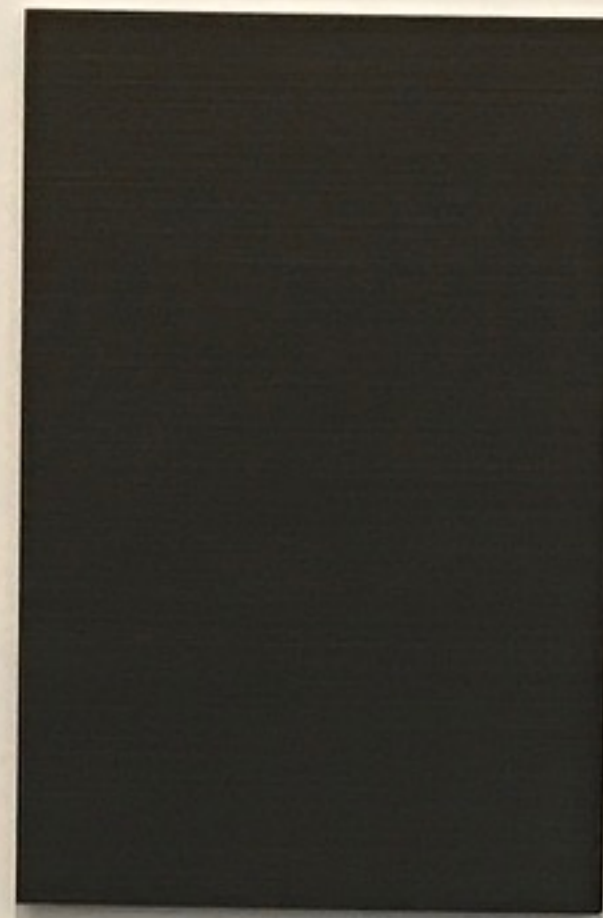
METAL PANEL 2