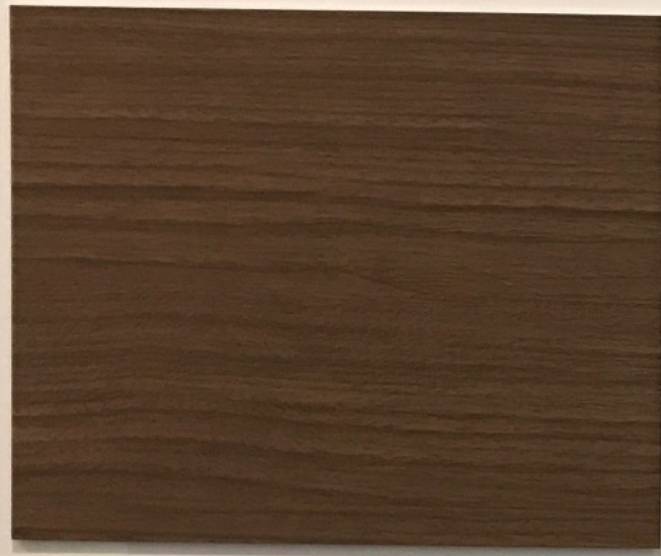
METAL PANEL 1