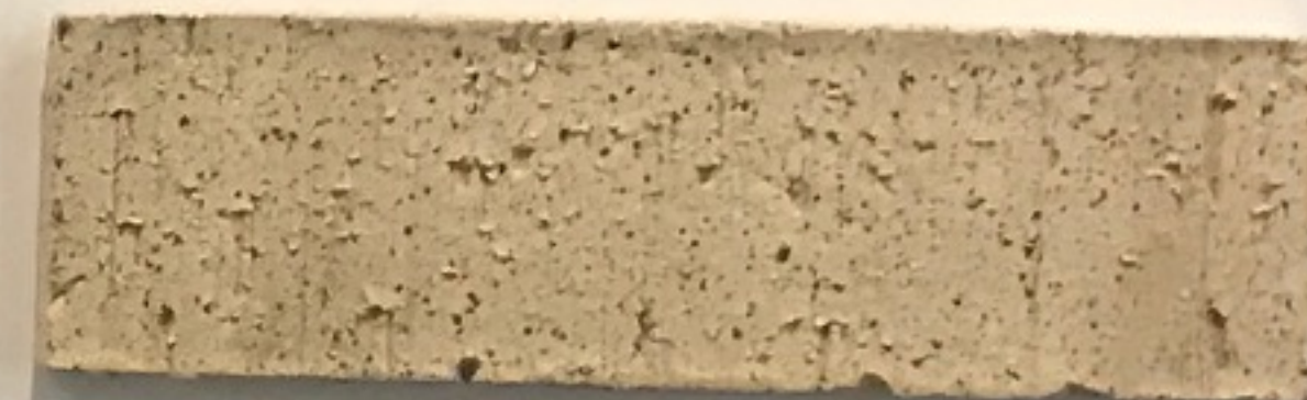
FULL BRICK VENEER