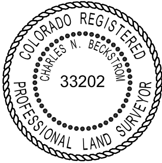
EXHIBIT A ILLUSTRATION

SOUTH BLACKHAWK STREET (70' PUBLIC R.O.W.)