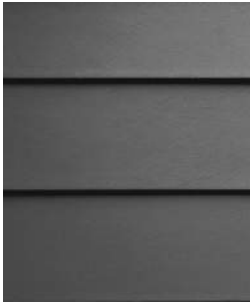
LAP SIDING 1 (FCS - 1)