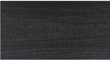
COMPOSITE WOOD SIDING (CWS - 2)