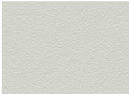
STUCCO 1 (CPS - 1)