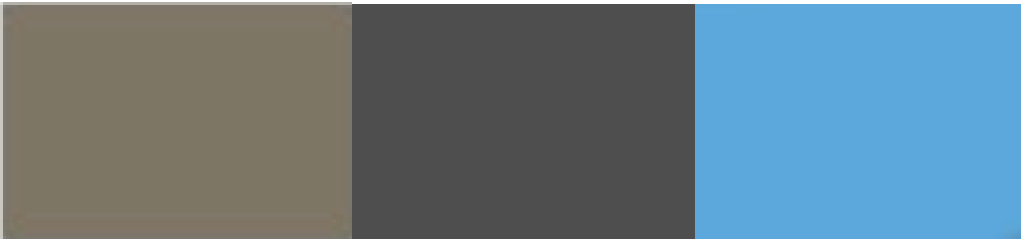
BREAK METAL (BM - 1)