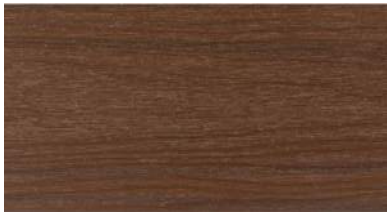
COMPOSITE WOOD SIDING (CWS - 1)