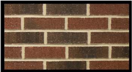
BRICK 1 (BR - 1)