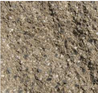
CONCRETE MASONRY UNIT (CMU - 1)