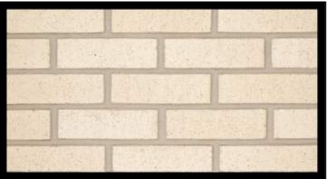
BRICK 2 (BR - 2)