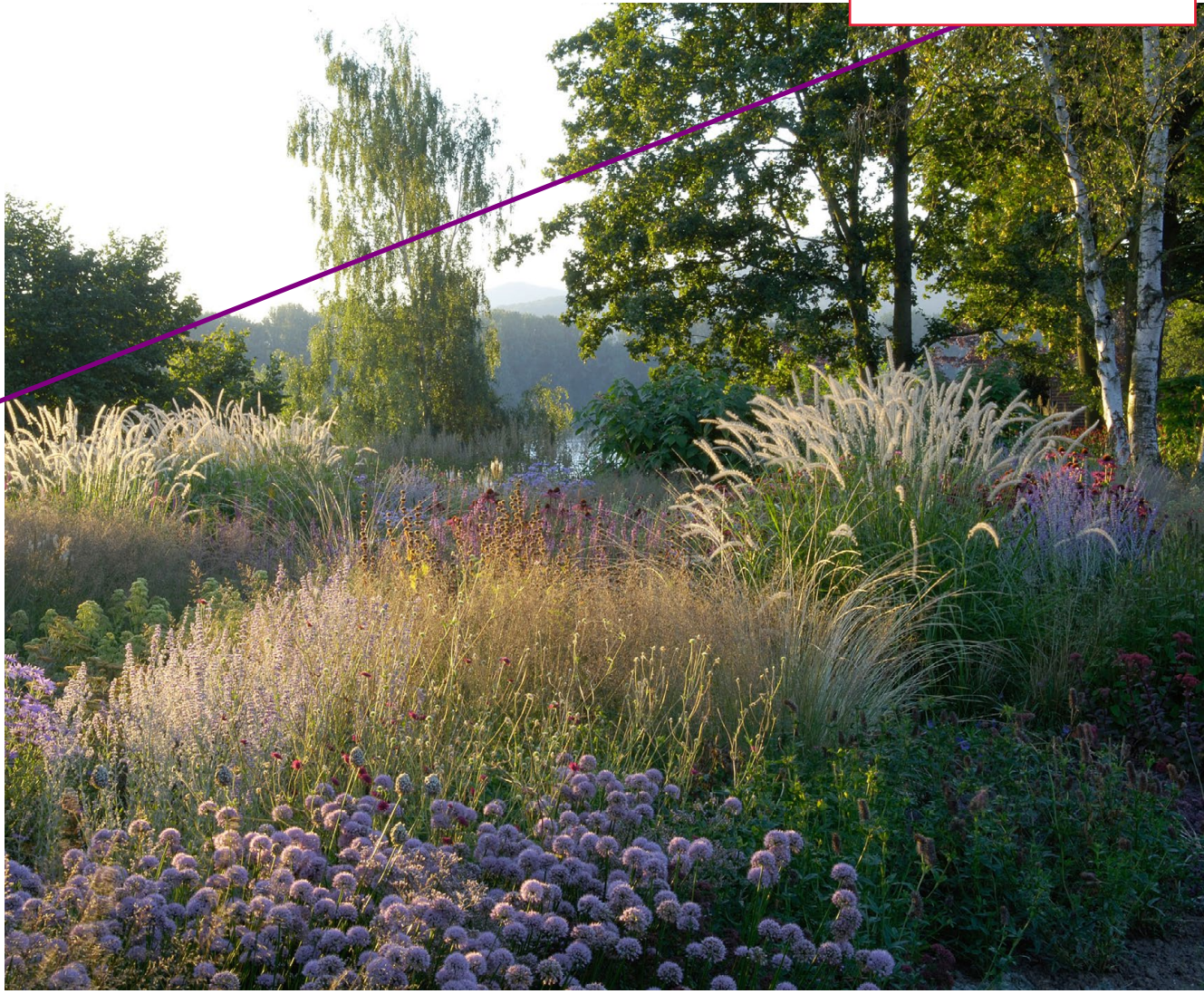
Trees have been added.