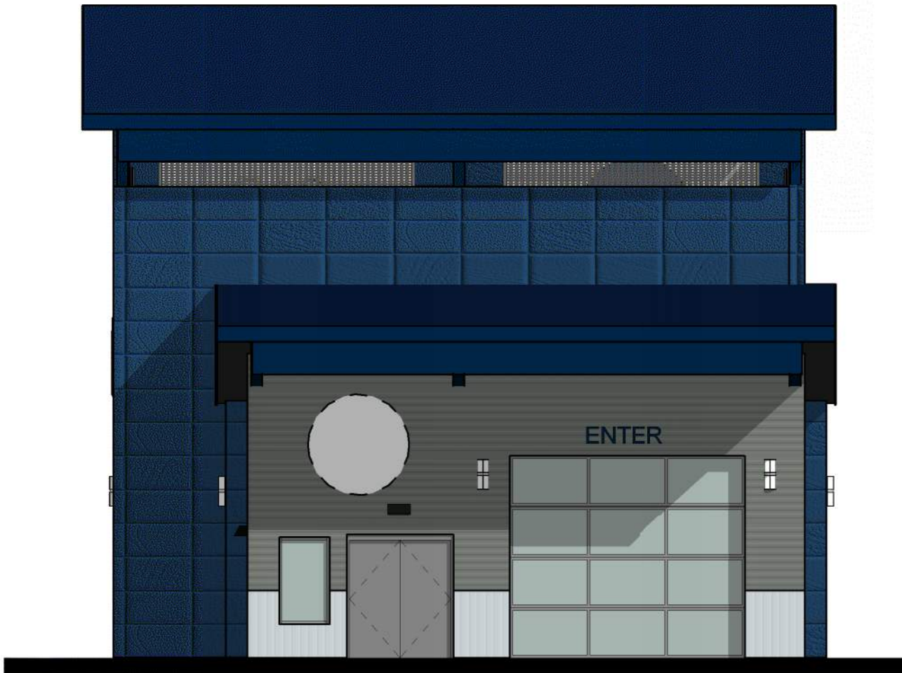
2 11 of 10 EAST ELEVATION 1/8" = 1'-0"