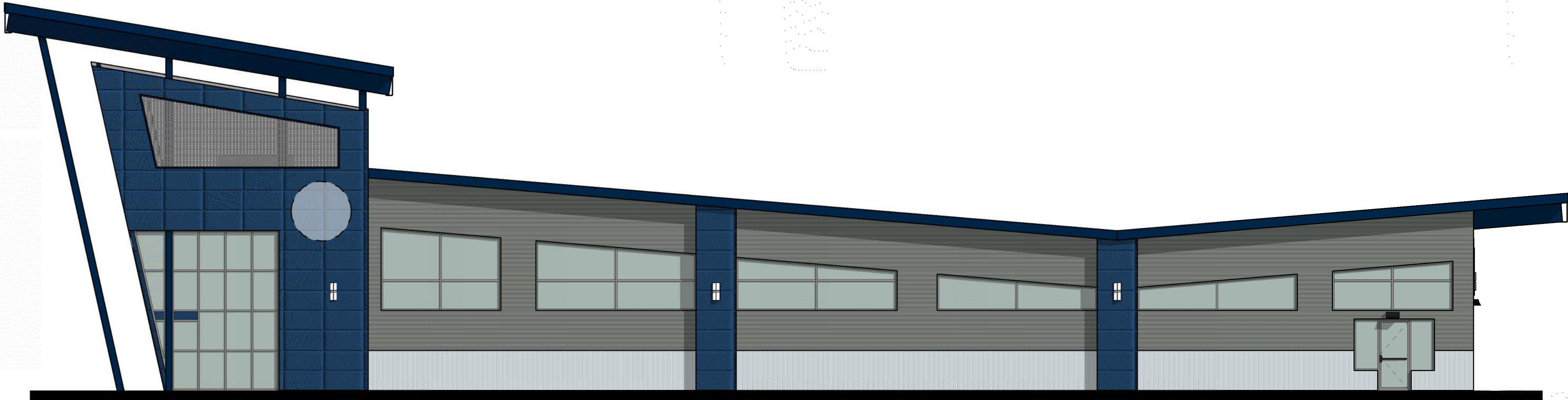
4 11 of 10 SOUTH ELEVATION 1/8" = 1'-0"