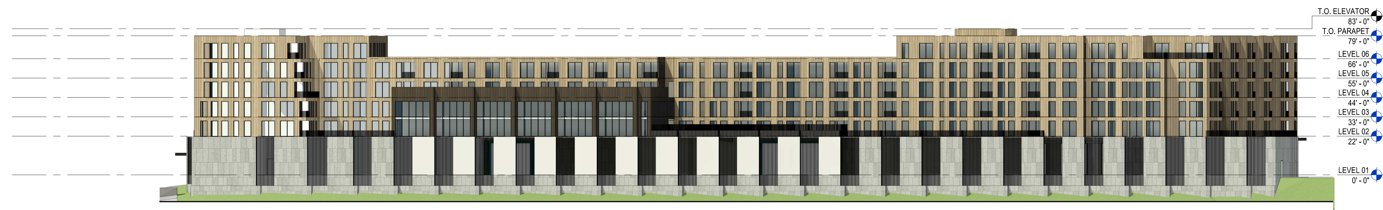
SABLE BOULEVARD ELEVATION

2575 East Camelback Road Suite 175 Phoenix, AZ 85016 United States Tel 602.523.4900 Fax 602.523.4949