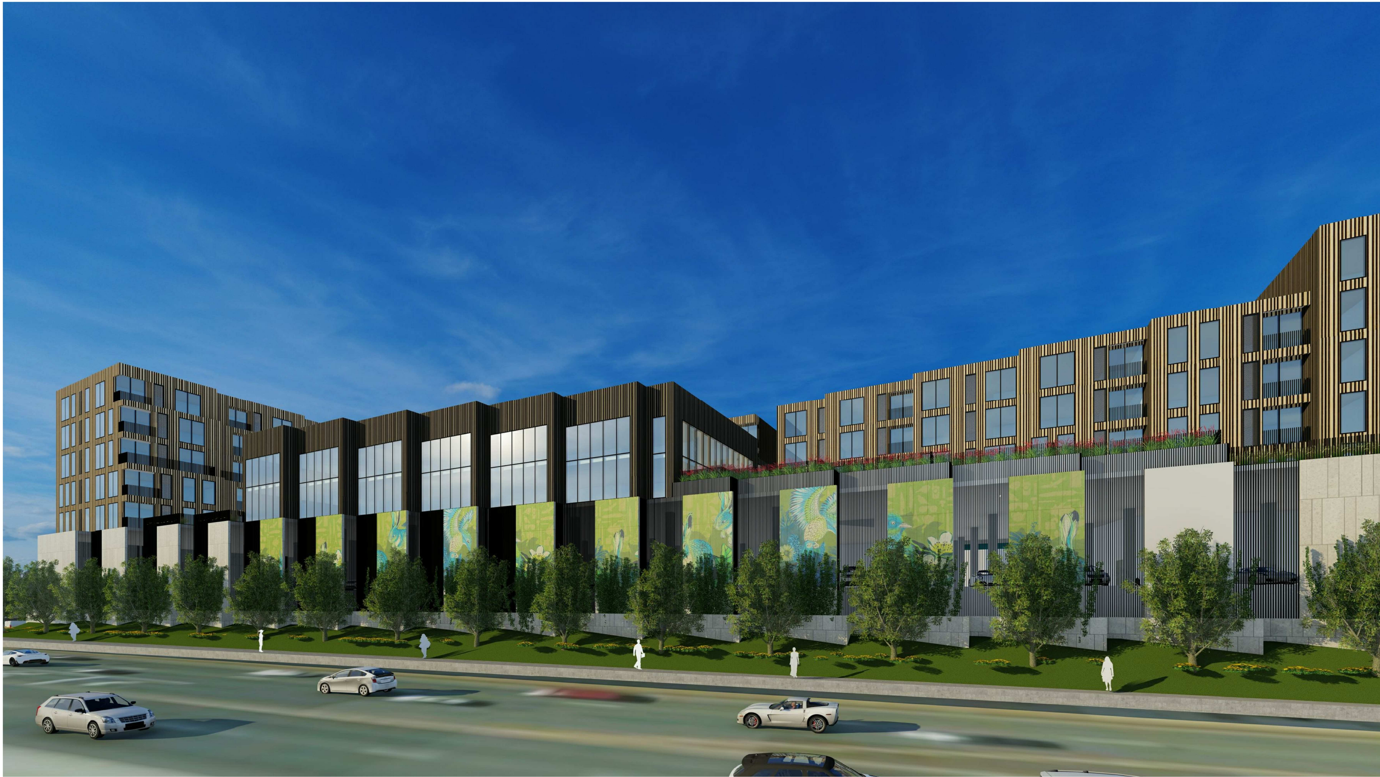
SABLE BOULEVARD PERSPECTIVE

11/10/2021 17:24:12 PM BM 360/057 8300.000 - Town Center ResidentialArchitecture - 57.8300.000 - Town Center_RESIDENTIAL.rvt