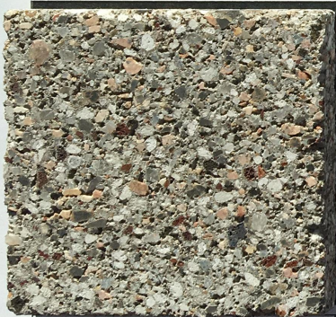
CMU: BASALITE, 900R, 8X16, GROUND/SPLIT FACE