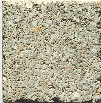
CMU: BASALITE, 701R, 4X16, GROUND FACE