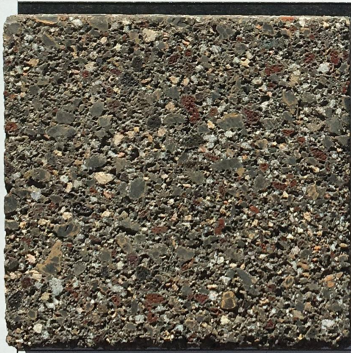
CMU: BASALITE, 807R, 8X16, GROUND/SPLIT FACE