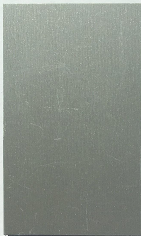
STOREFRONT: CLEAR ANODIZED