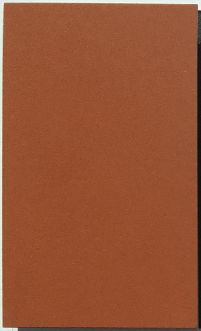
METAL PANEL: CENTRIA, 784 CLAY