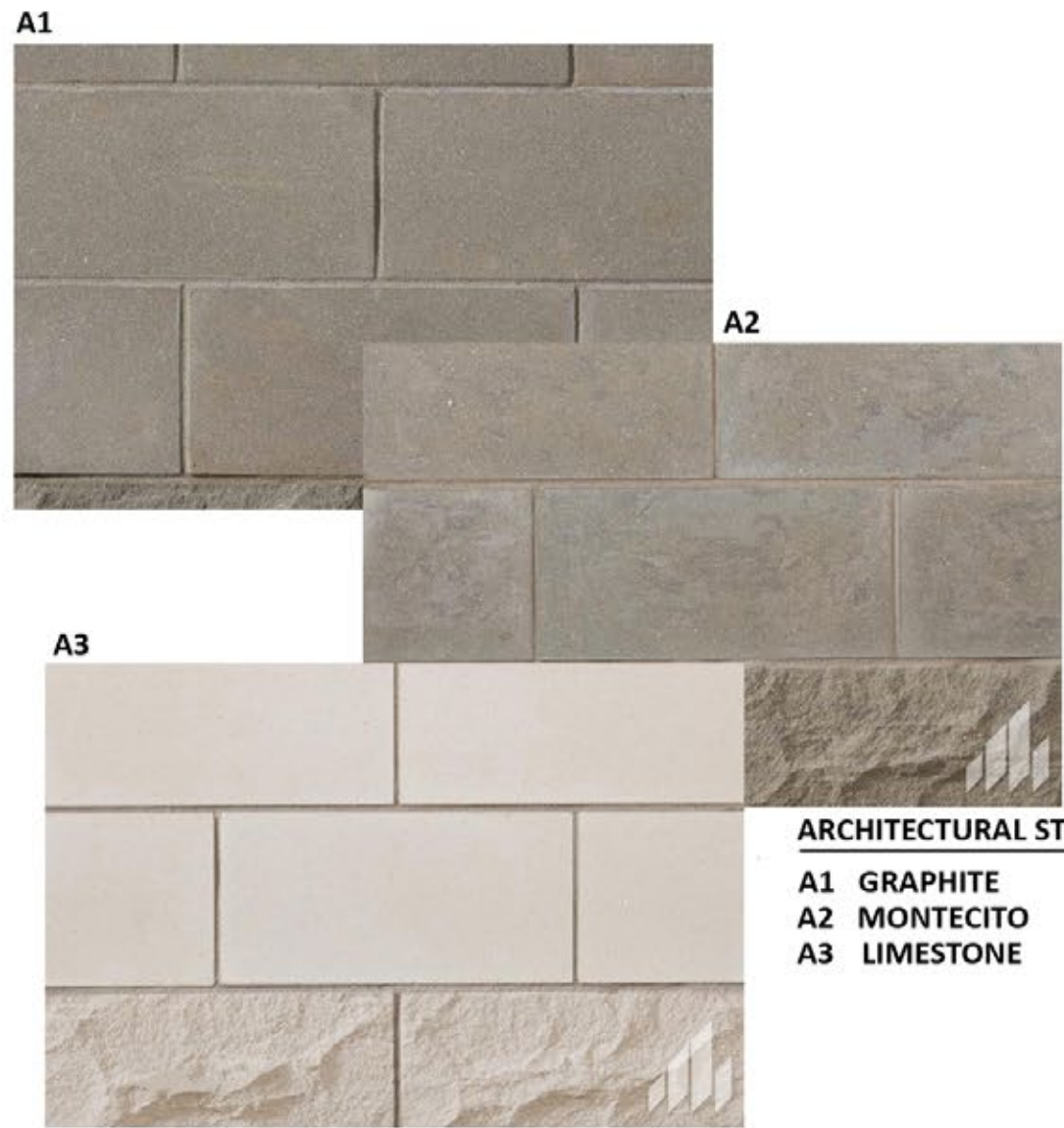
ARCHITECTURAL STONE: A1 GRAPHITE A2 MONTECITO A3 LIMESTONE