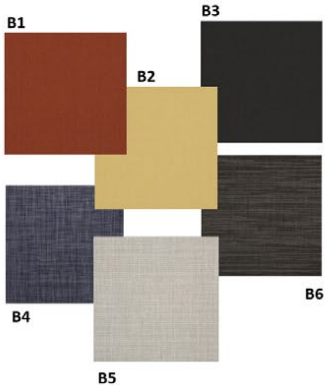
SHADES: B1 TRESCO CLAY B2 WHEAT B3 SLATE B4 SPA B5 ALLOY DUNE B6 ALLOY SILVER